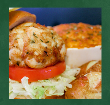
Maryland Crab Cake Sandwich & Crab Dip