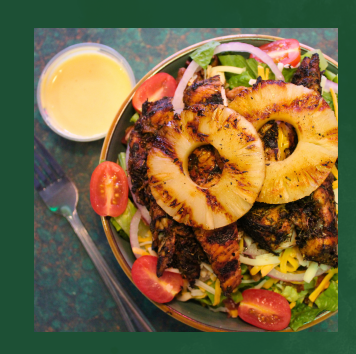
Jammin Jerk Chicken Salad